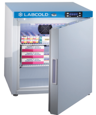
IntelliCold® Refrigerator Model: RLDF0110